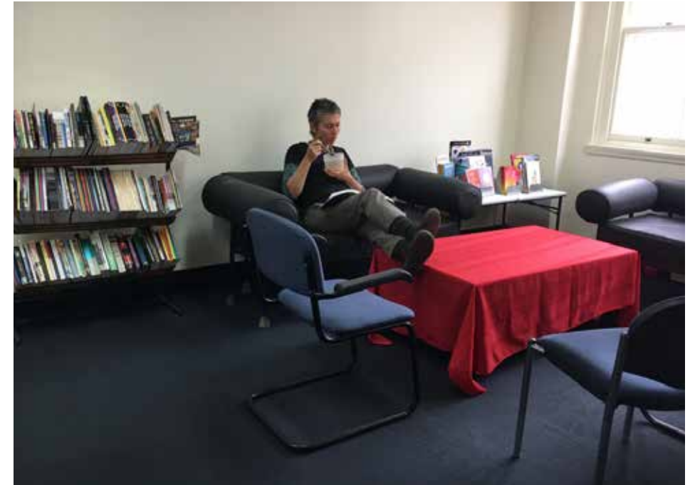
A place to relax, read and write

Tasmanian Writers Centre partnered events at the Seasonal Poets, Republic Readings and the Women's Poetry Oasis.