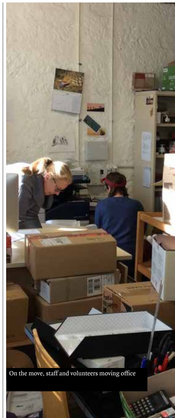
On the move, staff and volunteers moving office